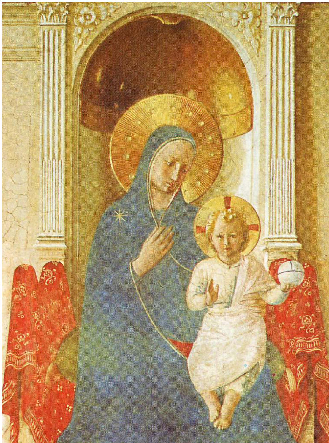
Fra Angelico—Virgin and Child (San Marco, Florence)

Rudolf Steiner also indicated that he (RS)—who was asked if the Master Jesus was then physically incarnated—responded positively and added that he (RS) stood in close inner connection with the Master Jesus, who was in the Carpathian Mountains: