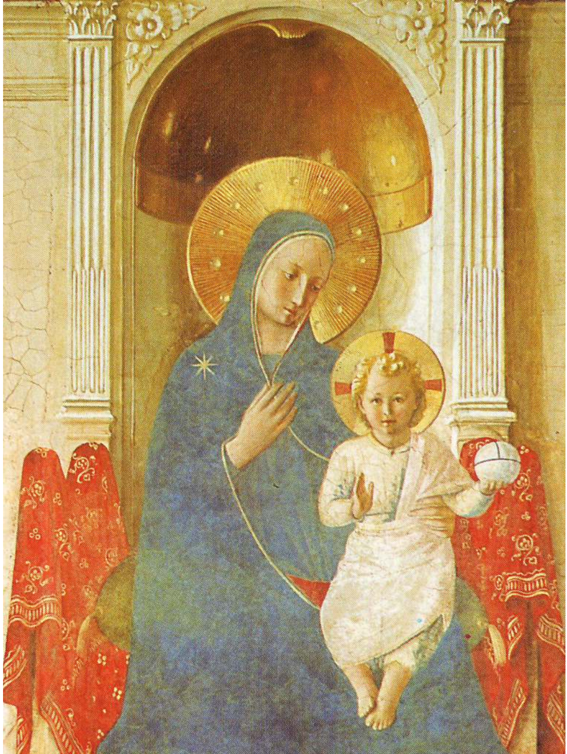
Fra Angelico—Virgin and Child (San Marco, Florence)

Rudolf Steiner also indicated that he (RS)—who was asked if the Master Jesus was then physically incarnated—responded positively and added that he (RS) stood in close inner connection with the Master Jesus, who was in the Carpathian Mountains: